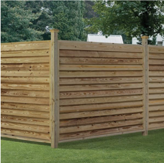
Louver (horizontal boards)