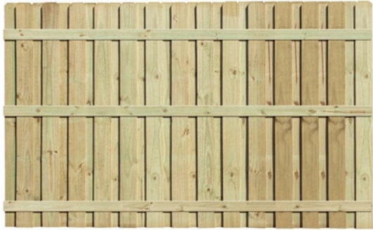
Board on Board (shadow or box, but touching)