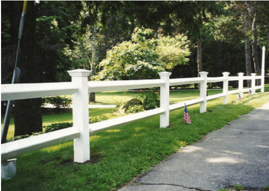
Rail or Post & Rail