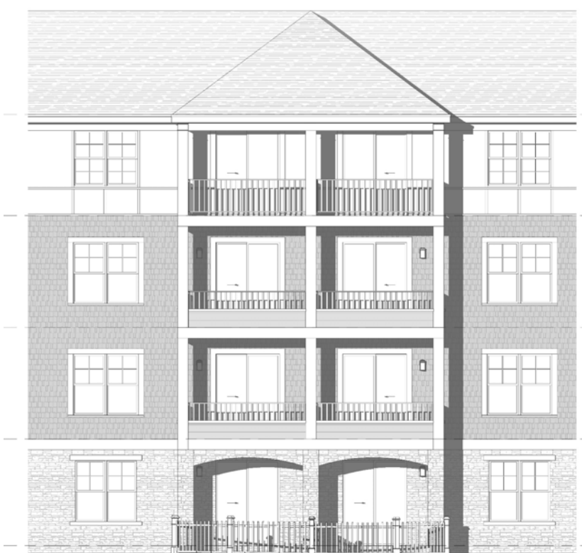
③ OPTION 2 - HIP ROOF 1/4" = 1'-0"