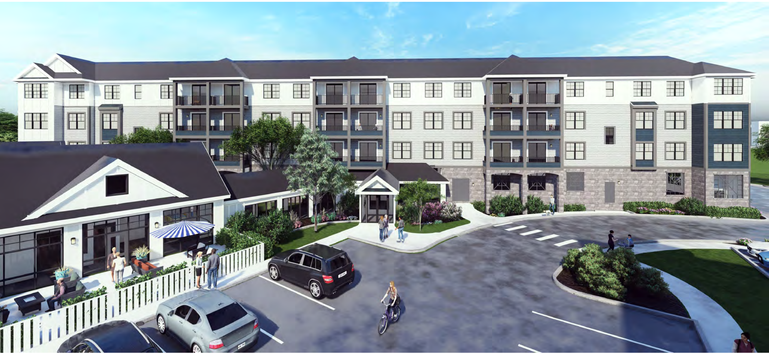
OPTION 2: HIP ROOF