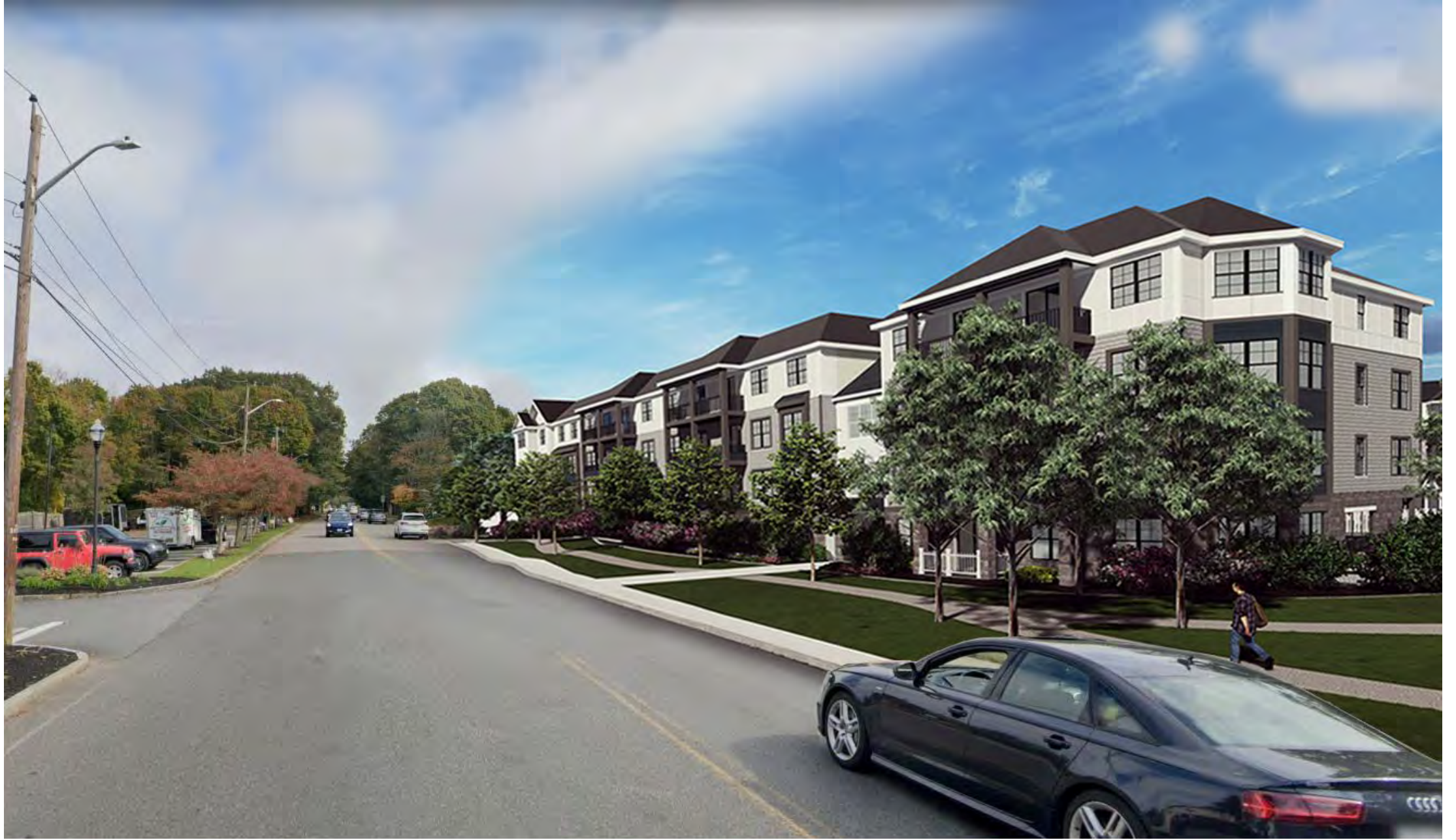
OPTION 2: HIP ROOF