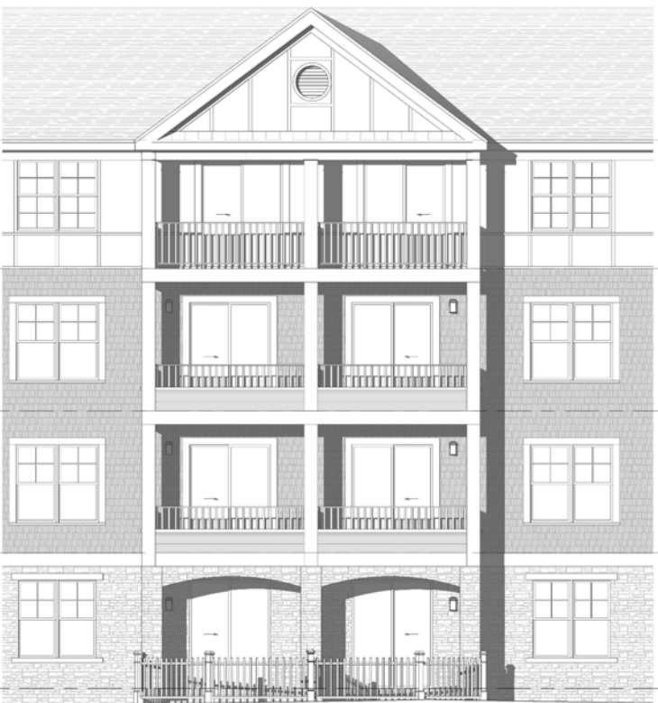
① ORIGINAL DESIGN 1/4" = 1'-0"