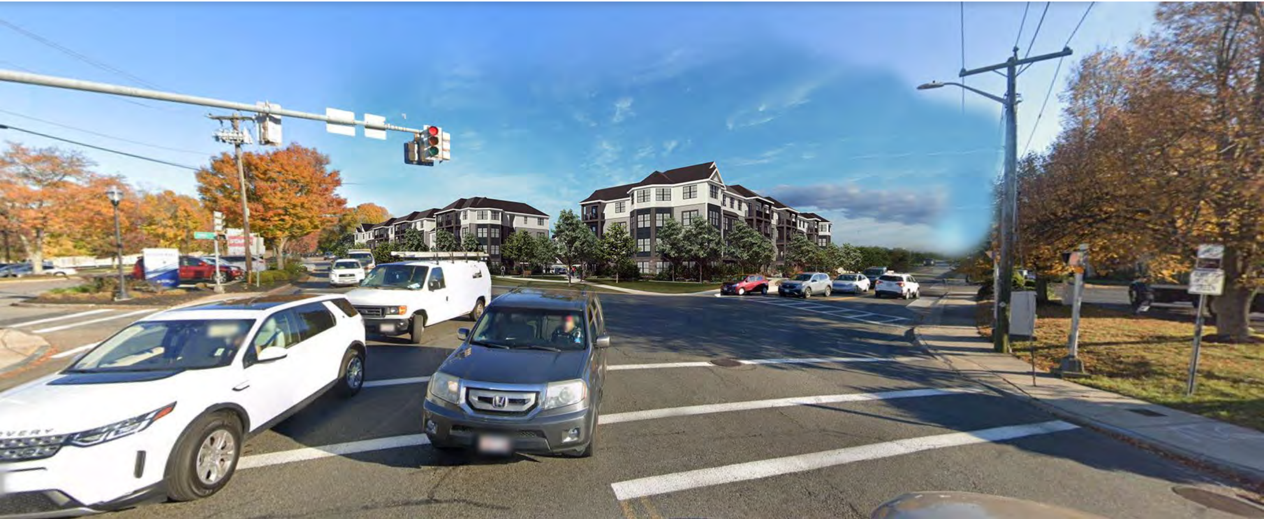
OPTION 2: HIP ROOF