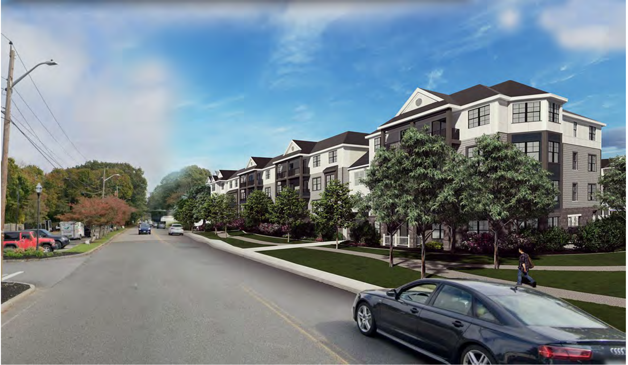
OPTION 1: DUTCH HIP ROOF