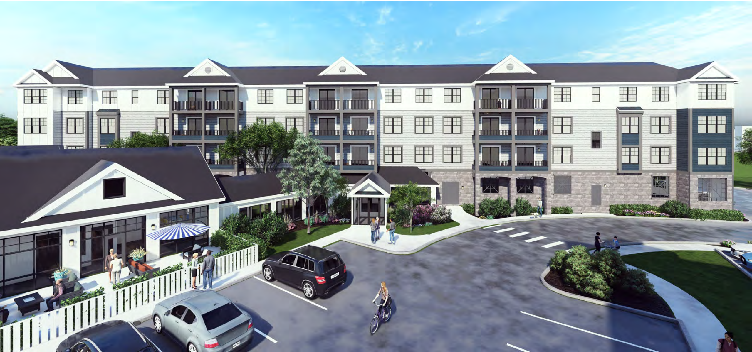
OPTION 1: DUTCH HIP ROOF