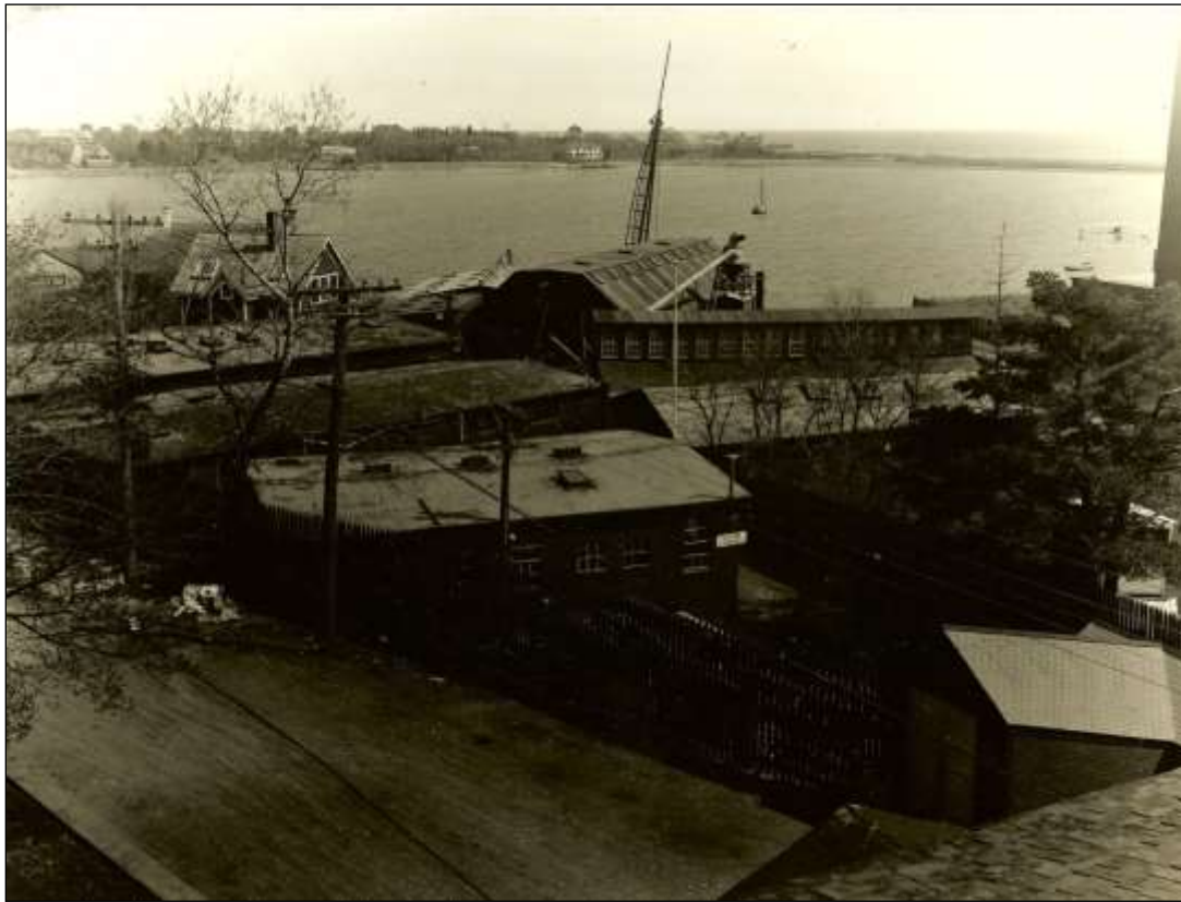
Early 20th century view facing SE from the roof of 58 Gregory St. showing the